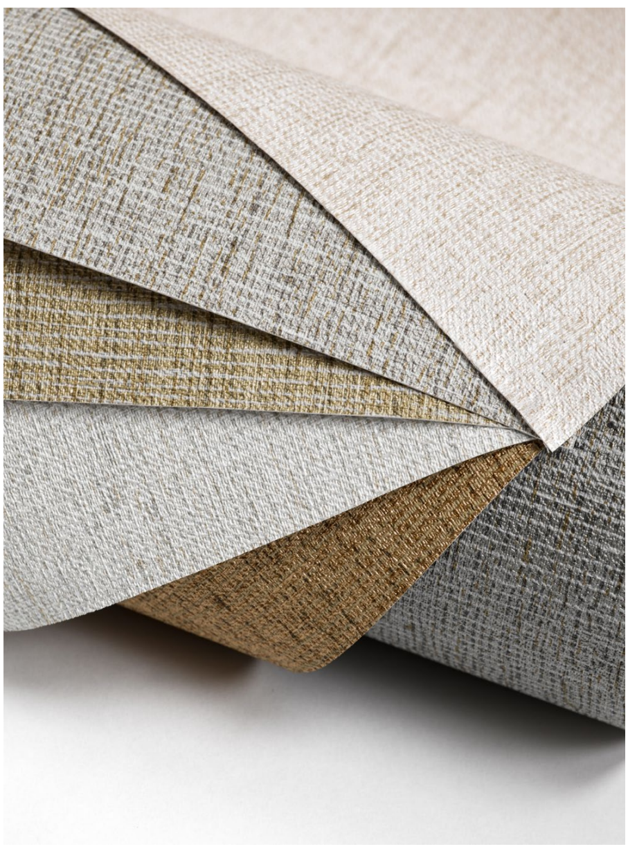
NSF® Certified Environmental Product Declaration www.nsf.org

Program Operator NSF® International EPD Registration Number EPD 10829 Date of Publication 7/1/2023 Date of Validity 7/1/2028