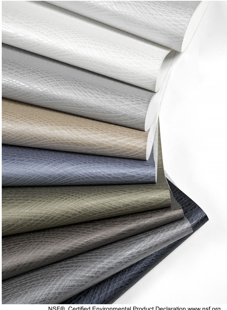
NSF® Certified Environmental Product Declaration www.nsf.org

Program Operator NSF® International EPD Registration Number EPD 10830 Date of Publication 7/1/2023 Date of Validity 7/1/2028