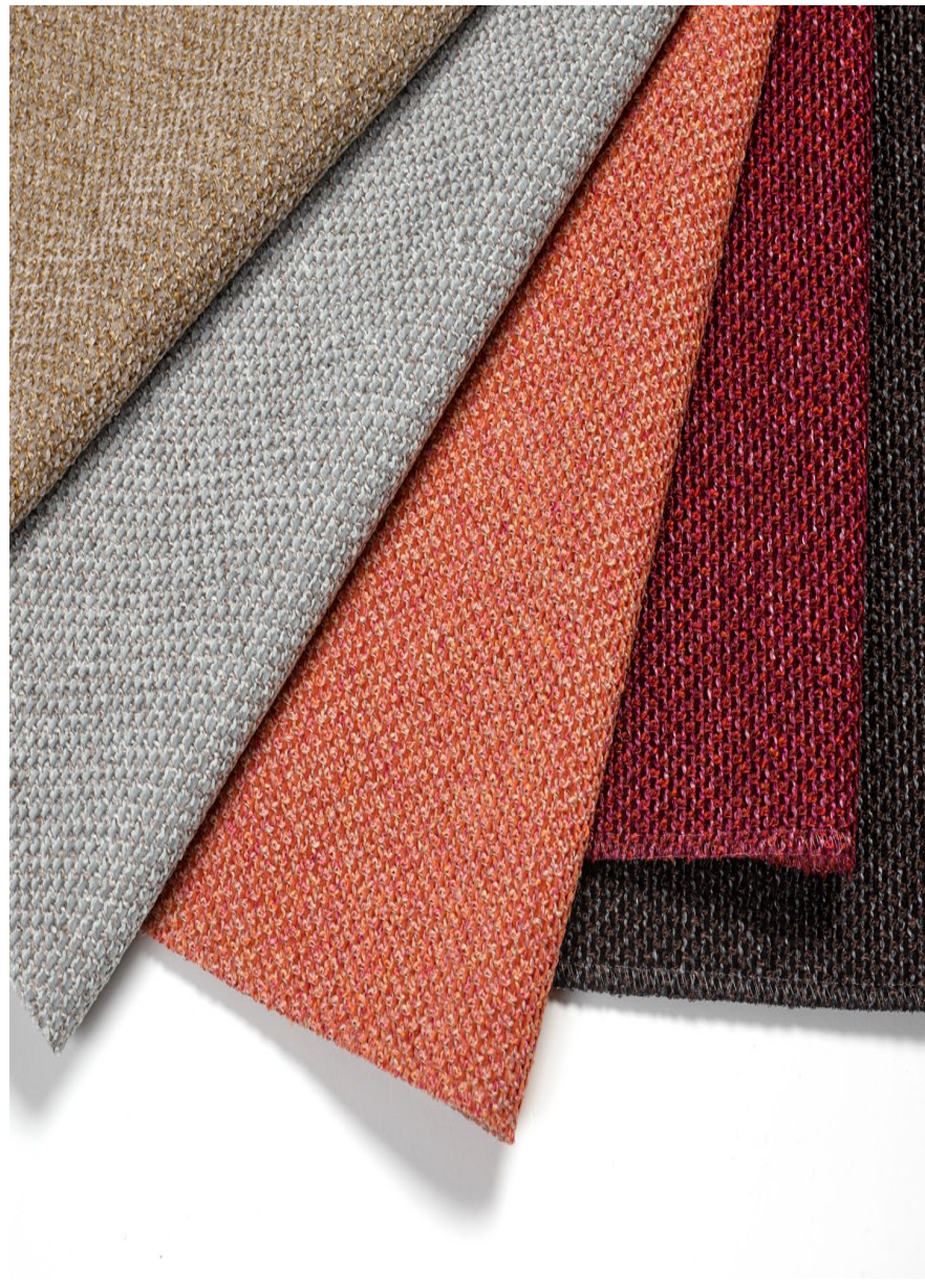
NSF® Certified Environmental Product Declaration www.nsf.org

Program Operator NSF® International EPD Registration Number EPD 10831 Date of Publication 7/1/2023 Date of Validity 7/1/2028