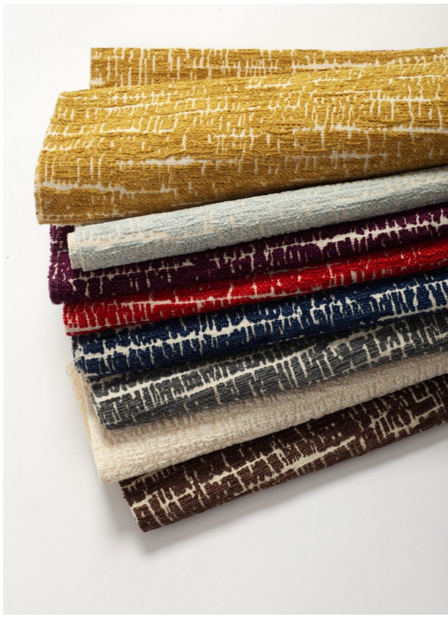
NSF® Certified Environmental Product Declaration www.nsf.org

Alignment, Alignment Backed, Beacon, Bistro, Circle Line, Commuter Cloth, Criss Cross, Delite, Durand, Helios, Messa, Plaidtastic, Prep, Quest, Reflect, Samos, Soiree, Tabloid, and Woodland II