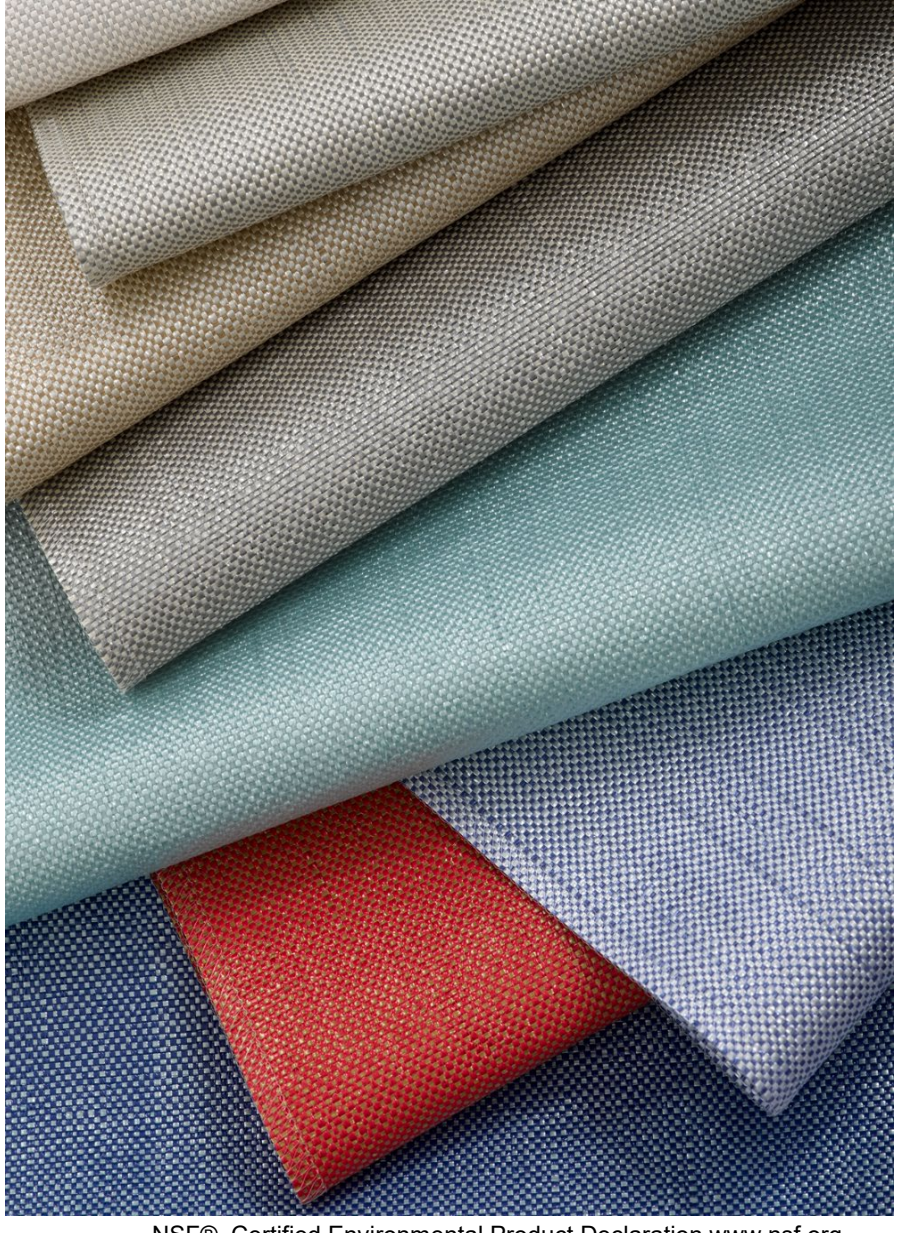
NSF® Certified Environmental Product Declaration www.nsf.org

Program Operator NSF® International EPD Registration Number EPD 10835 Date of Publication 7/1/2023 Date of Validity 7/1/2028