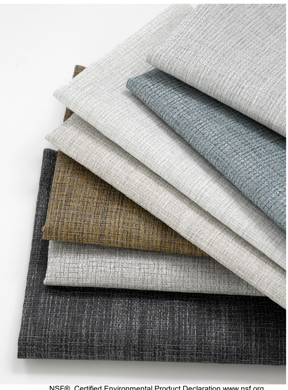
NSF® Certified Environmental Product Declaration www.nsf.org

Program Operator NSF® International EPD Registration Number EPD 10838 7/1/2023 Date of Publication 7/1/2028 Date of Validity