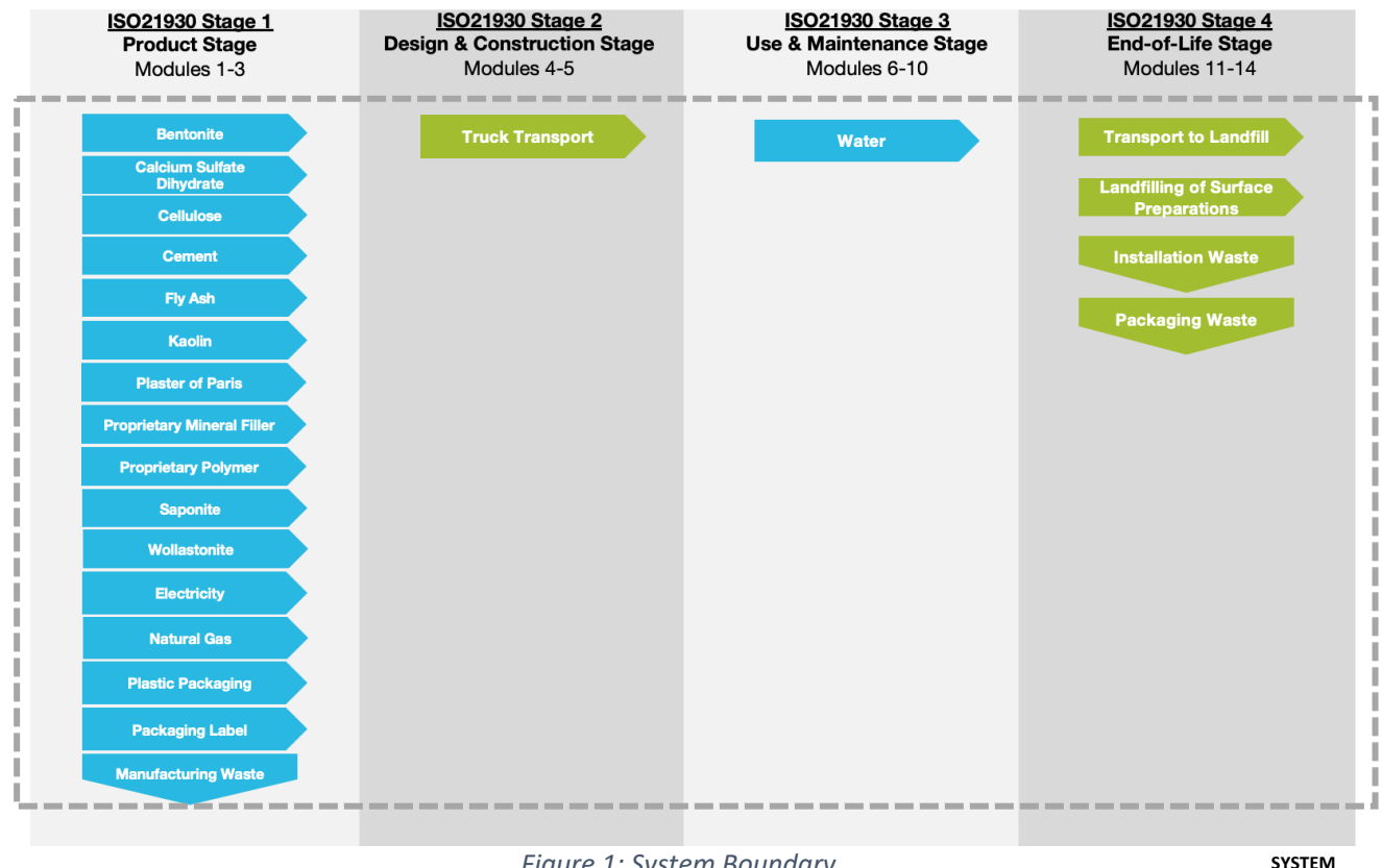
Figure 1: System Boundary

This LCA is a Cradle-to-Grave study. An overview of the system boundary is shown in Error! Reference source not found.