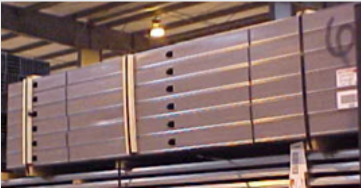
Figure 1: Skid of Nonstructural Framing

ProSTUD Drywall Framing with DiamondPlus Coating is packaged and shipped in skids. Products are generally nested together in pairs, then stacked with other sets of nested pairs and are held together using banding and wood dunnage (See Figure 1).