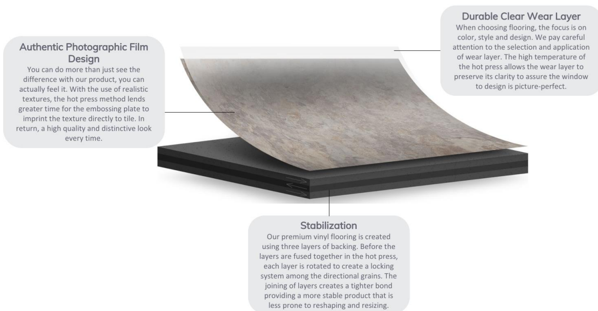
Figure 1: Product Construction

In addition, Parterre LVT is indoor air quality certified, conforming to California Specification 1350, and offers a moisture barrier that prevents microbial growth. Products included in this EPD are also FloorScore® certified and may be eligible for LEED credits.